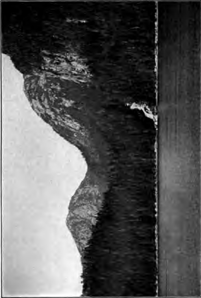
HANGING VALLEY AND WATERFALL, FRASER REACH